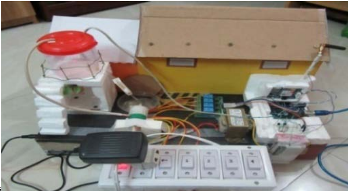
Figure 3: Fig. 3 :AFig. 6 :