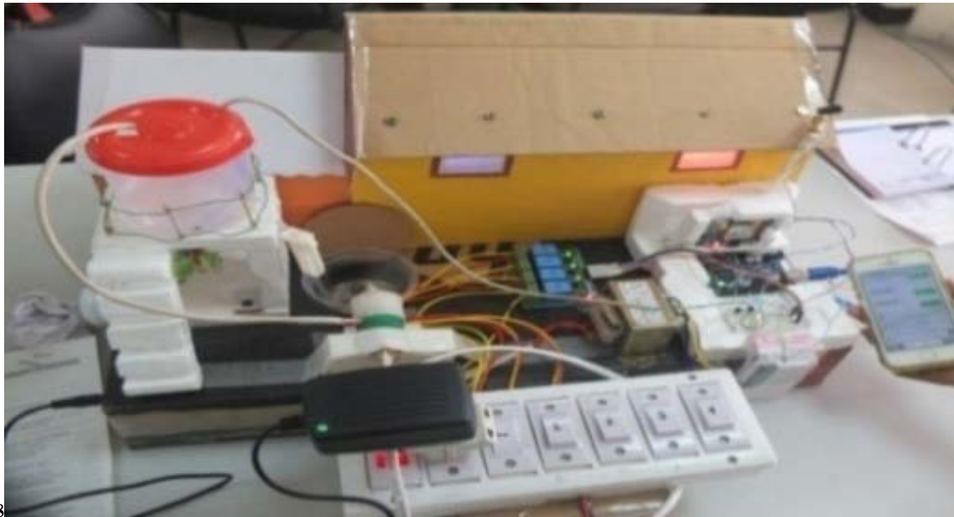
Figure 5: Fig. 8 :