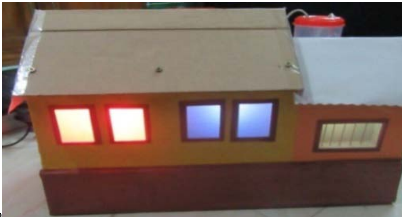
Figure 6: Fig. 10 :