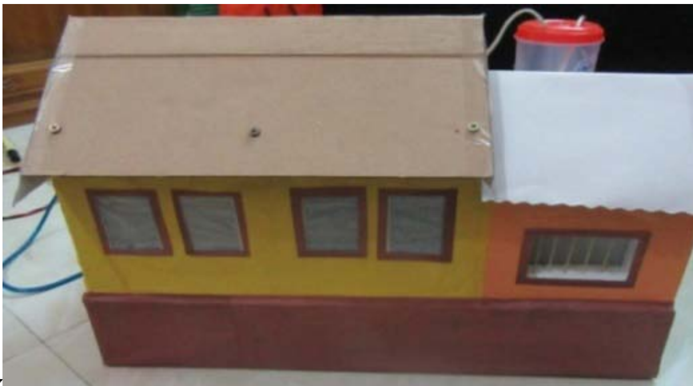
Figure 4: Fig. 7 :