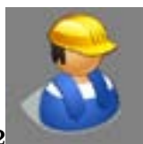
Figure 1: Fig. 1 :