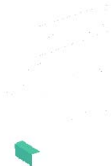
Figure 4: I