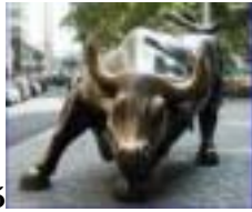
Figure 7: Figure 2 :