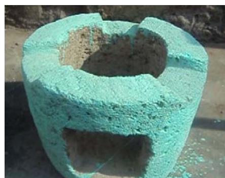
Pictures 1a: volcanic rock, 1b: Stove made in volcanic rock, 1c: Painted stove made in volcanic rock