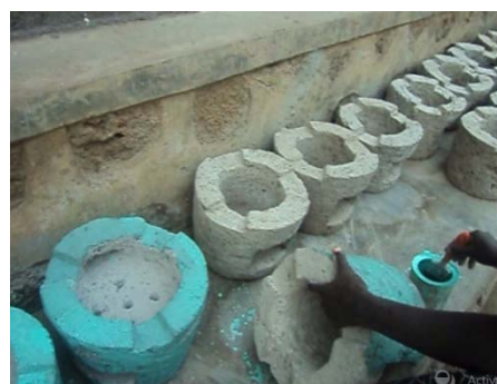
Pictures 2 : volcanic stoves (RONDEREZA URUTARE) in the painting process at Muneza Biomass Engineering Company site