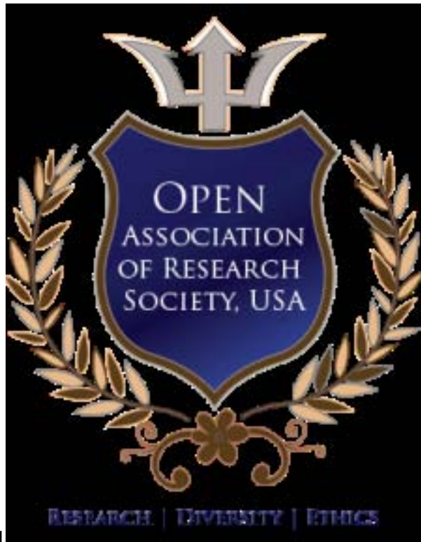
Figure 1: Fig. 1 :