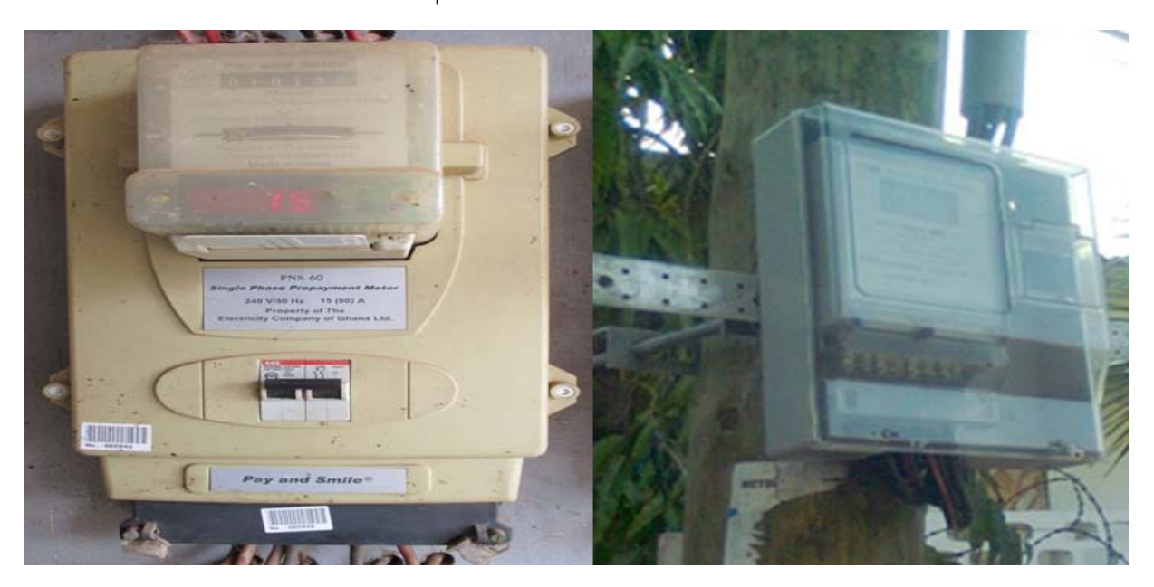
Figure 3: Prepaid Meters (a) Home Type

In spite of the fact that they have not finished changing all the traditional EIMs to Pre-Paid ones, it is speculated that they will introduce 'Smart Pre-Paid Meters' in 2014. Surprisingly, they are replacing existing pre-paid card meters or the smart cash meters to 'Pole prepaid card meters' which leaves customers to various risks. This is because consumers 'lives and properties are posed with danger with the "pole metering system", especially when consumers leave their secured house to poles on the street to reload credit to the pre-paid meter. Now the big question still holds "do these pole meters address our metering challenges?"