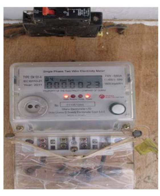
(b) Electronic Type

b) Pre-Paid/Smart Cash (as called in Ghana) or Prepayment Electric Metering Technology