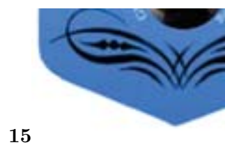
Figure 4: Fig. 15 :