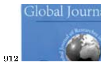
Figure 3: Fig. 9 :Fig. 12 :